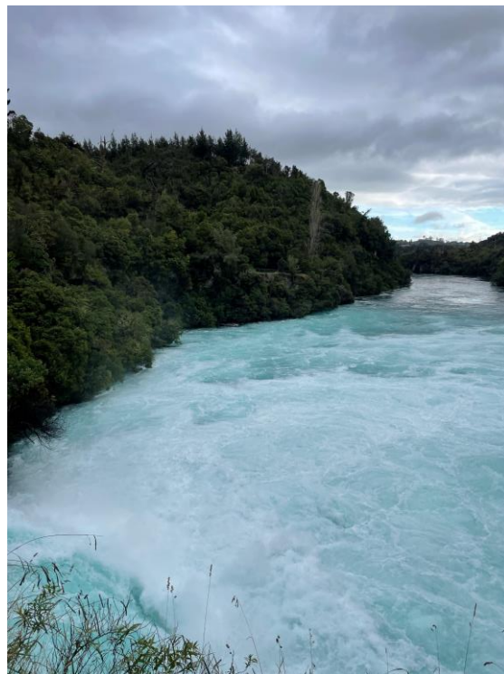
Figure 2: Huka is Maori for Foam, shown by the gorge