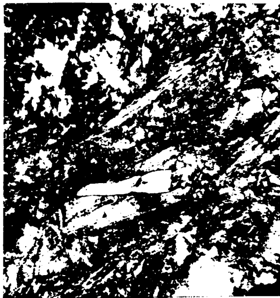
Before strain, light microscopy, 500 X,

Deformation of a highly-oriented graphite (ZTA) was studied using the above technique. Several magnifications were tried, but 500X was the most satisfactory for optical microscopy while 5000X appeared best for electron microscopy.