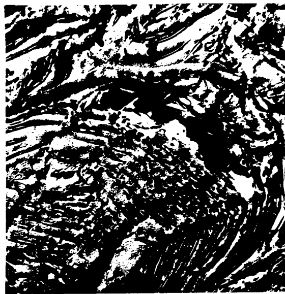
after 5% strain.