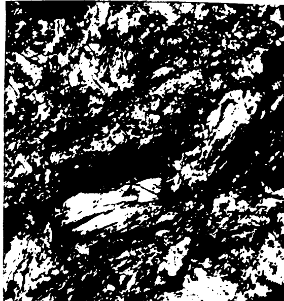
after 5% strain.