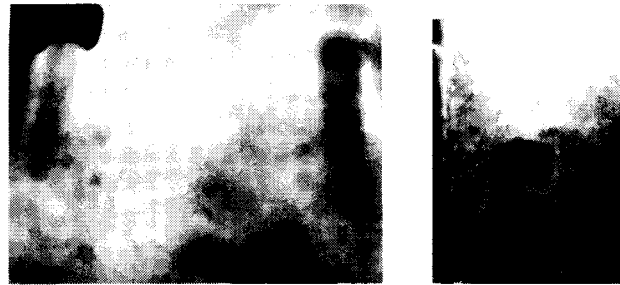
Fig. 2, radiographs of segments encapsulated with new bone