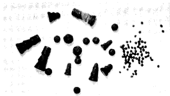
Fig. 1, carbon cones, cylinders, segmented spheres and particles